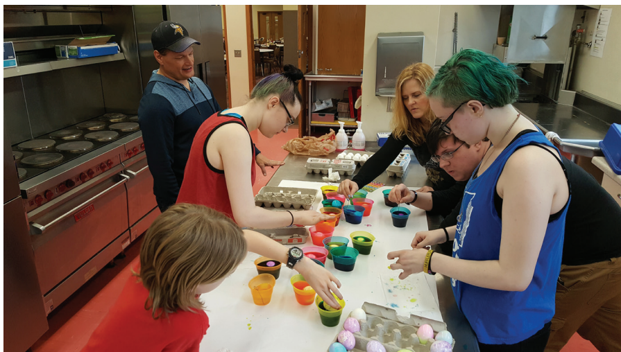
Youth, young adults and some adult assistants prepared for the annual Easter Breakfast by dyeing eggs. The youth and young adults raised $310 to be donated to Lutheran World Relief. Thanks to all members and visitors for supporting this ministry of Mt. Carmel.