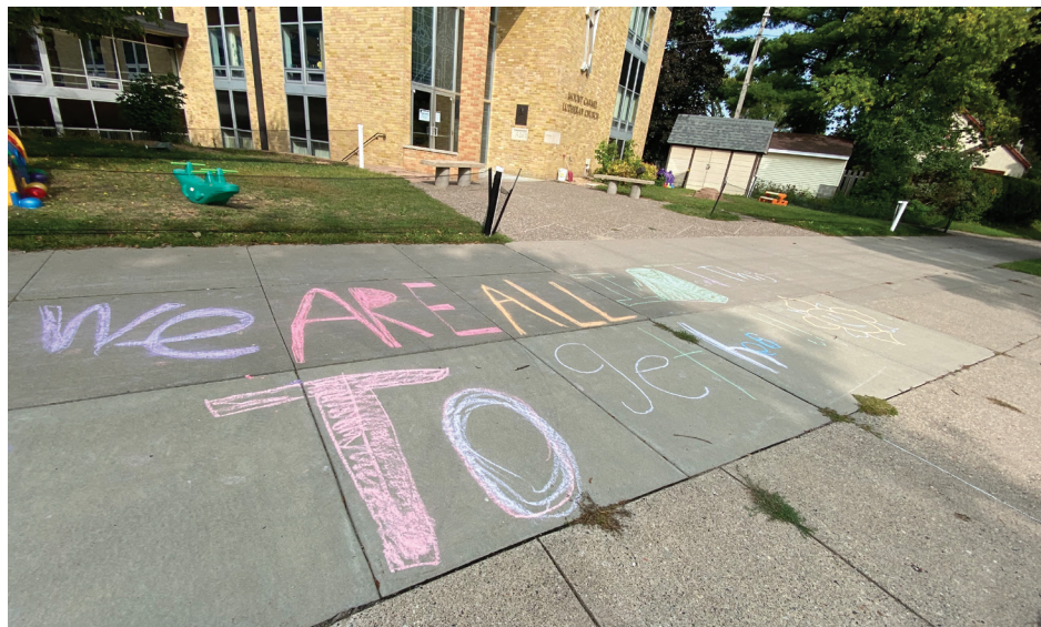
Sidewalk chalk art courtesy of Girl Scout Troop 17026!

To to lift up a prayer concern for the prayer chain, please contact Leona Olson at 612-859-7075.