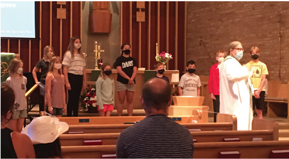
Ten Mt. Carmel youth were sent off to Camp Wapo in August with a special blessing during worship.